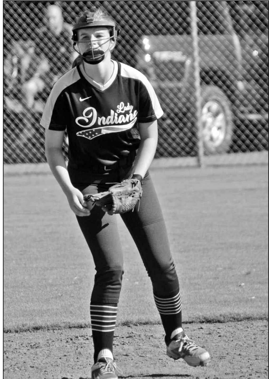
The Towns County Lady Indians fell 9-0 last Tuesday in a Region 8-A contest at Lake Oconee Academy in Greensboro. On Thursday, Towns County traveled to Rabun County for a non-region contest against the Lady Cats. Unfortunately, Towns came out on the wrong end of a 10-0 shutout. The Lady Indians continue their non-region stretch when they host Cedar Shoals on Tuesday. First pitch vs. the Lady Jaguars is scheduled for 5 p.m.